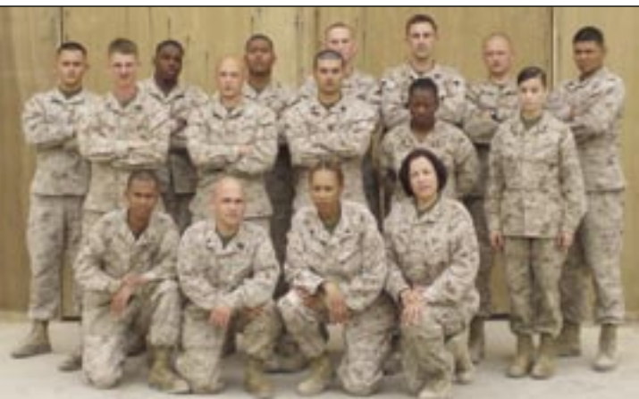
Marines in Iraq sent this photo to Central Region. We thank YOU!