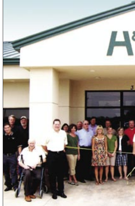
Ribbon-cutting ceremony at Pipeline's new HQ.

The Pipeline Division of the West Region recently conducted an open house celebration of their new office, shop, and storage facilities in Goldsby, Oklahoma. The Pipeline group moved from a nearby maintenance shop/building, which they built in 1981. As a result of sustained growth, and after nine