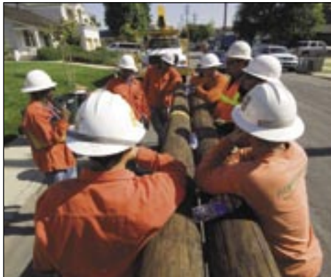
Power crews in Southern California attend a safety job briefing before beginning their day's work.

Four years ago, Henkels & McCoy joined with other leading power line contractors, the International Brotherhood of Electrical Workers, the Occupational Safety and Health Administration (OSHA), the National Electrical Contractors Association, and Edison Electric Institute (an association of utilities), to form a unique partnership to reduce the number of deaths and injuries in the industry.