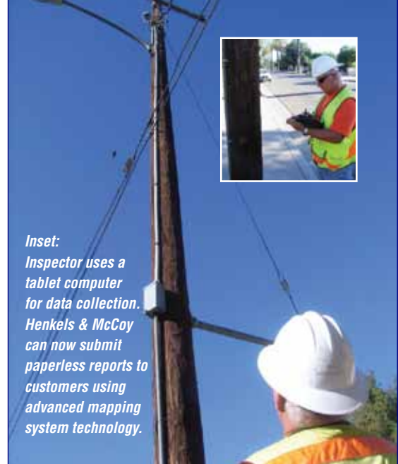
Inset: Inspector uses a tablet computer for data collection. Henkels & McCoy can now submit paperless reports to customers using advanced mapping system technology.

Typically utilized by government, utility and infrastructure, environmental, and public safety industries, a Mobile GIS can apply to field mapping, asset inventory, asset maintenance, inspections, incident reporting, and GIS analysis. It streamlines