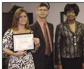
(Top right) An instructor provides one-on-one attention. (Center) The branding logo for the TSG program in South Carolina. (Bottom left) A student receives her certification.

Typical of TSG's programs, the training is funded through the Workforce Investment Act, established by Congress in 1998 and implemented in South Carolina in July 2000. The TWIB solicited competitive bids to achieve their mandate; TSG was awarded the contract through this process.