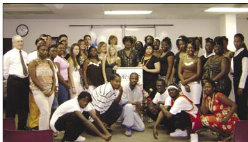
A TSG graduating class in South Carolina.