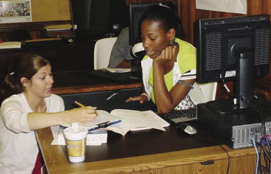
Interaction between student and instructor.