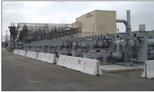
Glendale Water and Power's newly installed Gas Insulated Switchgear, with the old switchrack in the background.