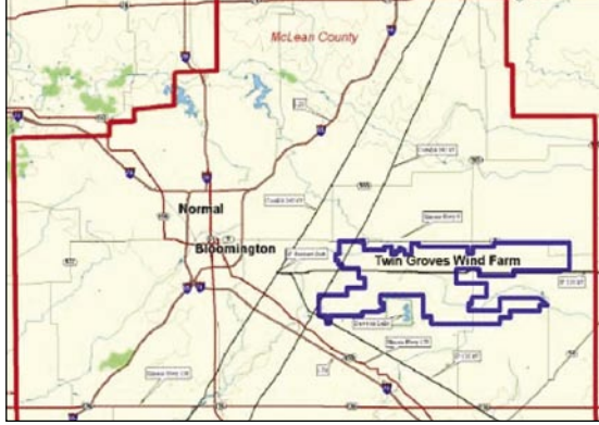
Central Illinois location of Twin Groves Wind Farm.

weather-related challenges including an unseasonable amount of rain and excessive winds. The wet conditions and winds resulted in delayed erection of the turbines. The wet soil conditions also created challenges for our trenching and backfilling crew, as collection system specifications required our crews to screen the native material prior to backfilling around the collection system cable. Placing twelve inches of screened backfill materials around the cable provided adequate thermal resistivity, which allowed the heat to dissipate. Henkels & McCoy met this challenge by utilizing specially fabricated equipment.